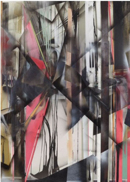
Nola Zirin. Suspension . Oil, enamel and glitter on canvas, 72 x 52 in.

Nola Zirin's recent solo exhibition titled Stardust features fifteen new works that introduced fifteen new paintings that introduced a unique, visual dynamism into the genre of abstraction while still reflecting the artist's signature layering process. Zirin rephrases pictorial space by exploring sweeping, painterly gestures that are set at sharp angles, creating a suggestion of three-dimensional space, placeless but familiar within the experience of one's subjective perception. Along with four very small collages Stardust presented eight large-scale paintings that wove glitter into painted surfaces, touching upon the flicker of