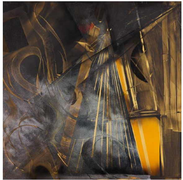
Zirin-Voyager 2013 oil enamel and glitter on canvas 60 x 60 inches.

The smoky atmosphere rendered in Voyager shows a swirl of gold and yellow paint shining across a black surface, laced with a white silhouette. Within this space measuring five-foot square, dark golden shades swirl and dance across the painting's far left margin as hints of industry and time fall to the center.