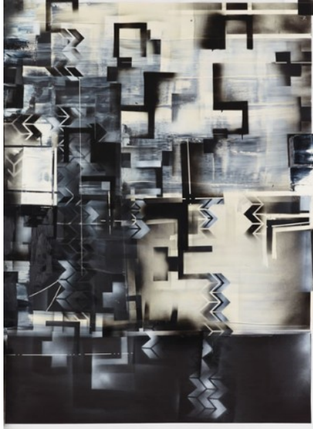
Nola Zirin. Invention 23 . Oil, enamel and glitter on canvas, 72 x 52 in.

Suspension measures six-feet by four-feet and features a vortex of colors that collect off-center, suggesting either a broken window or stained glass. Blue and black paint drips from above and below as this geometric mirage begets curiosity.