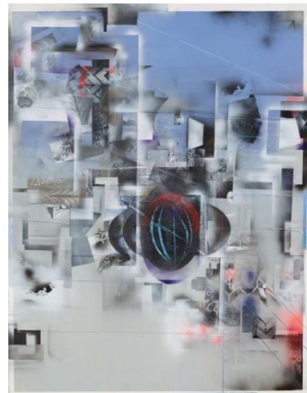
Nola Zirin. Orbit . Oil, enamel and glitter on canvas, 72 x 52 in.